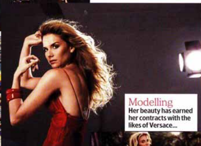
Modelling Her beauty has earned her contracts with the likes of Versace...