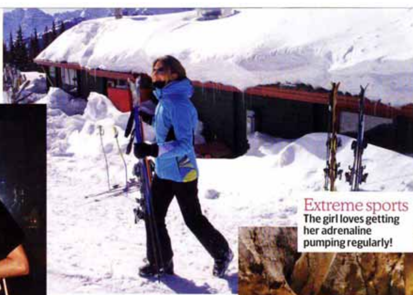
Extreme sports The girl loves getting her adrenaline pumping regularly!