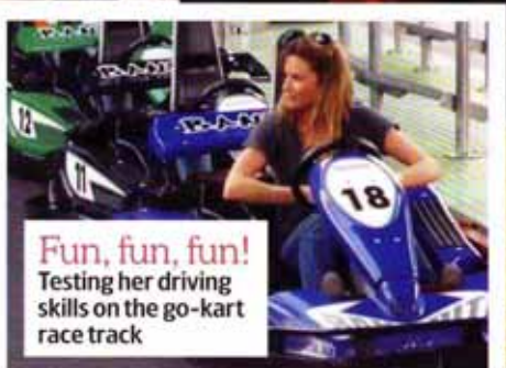
Fun, fun, fun! Testing her driving skills on the go-kart race track